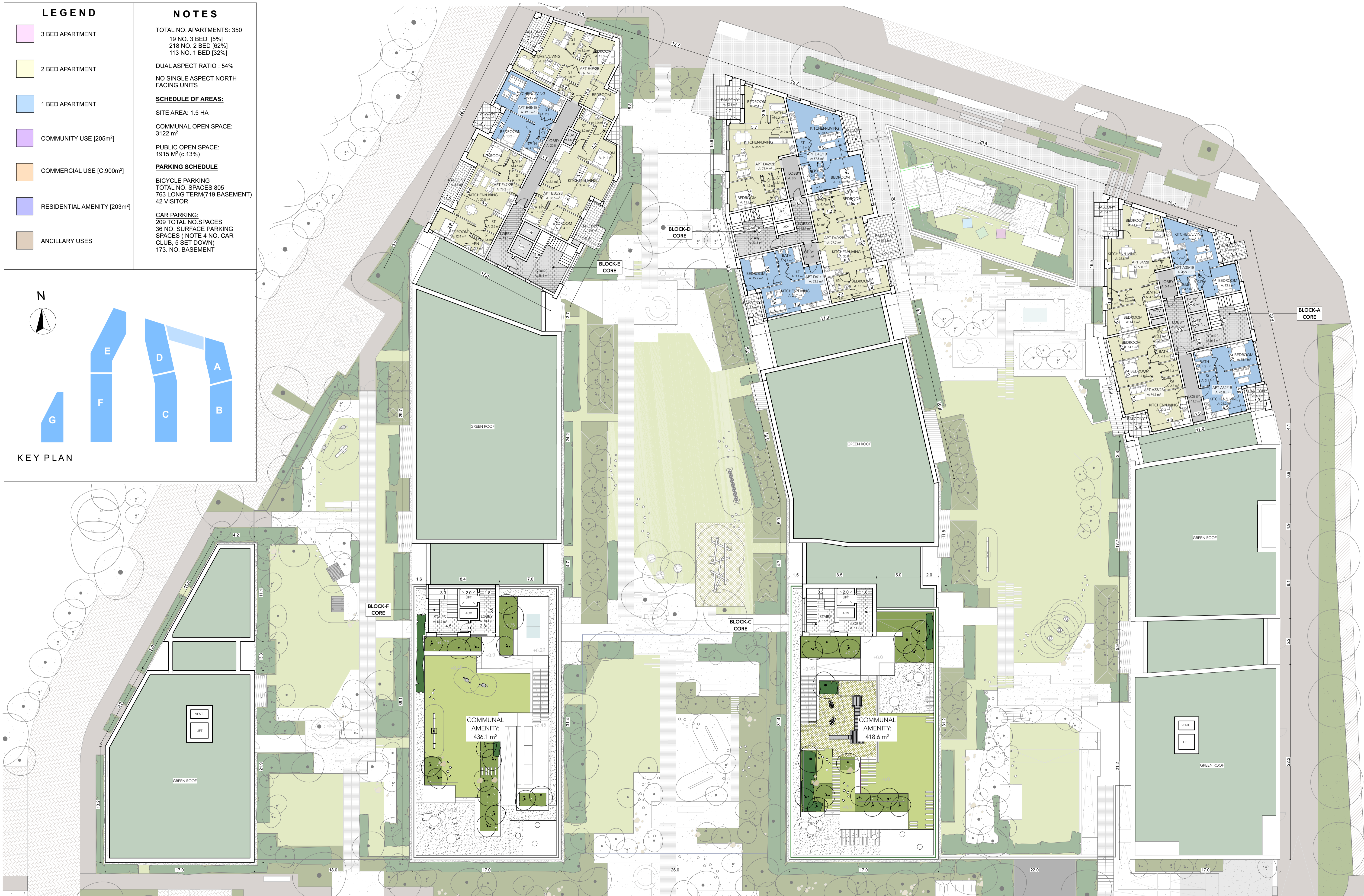
Seventh Floor Plan SCALE : 1:200